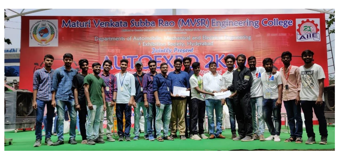
Winners of "Ride Your Pride" Student Competition at "Auto Expo 2K20", Hyderabad.