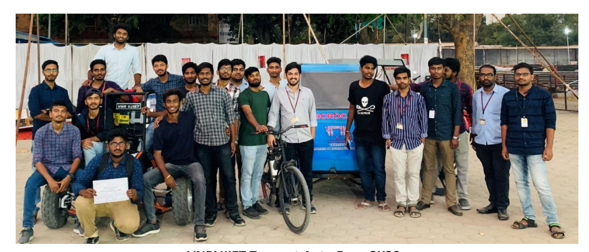
VNRVJIET Team at Auto Expo 2K20